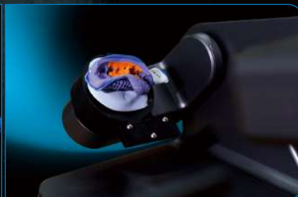
Post and Core